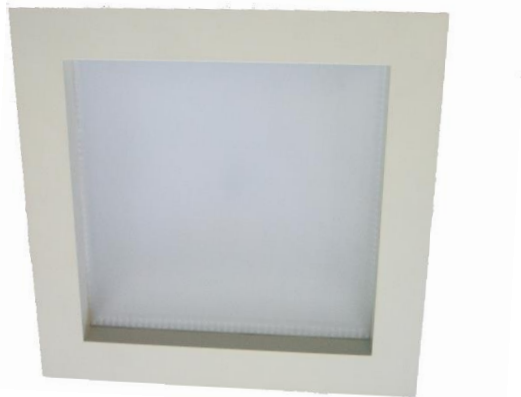
Cut-Out 200 x 200 mm