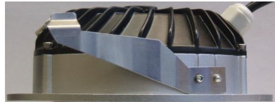
Cut-Out Ø 130 mm